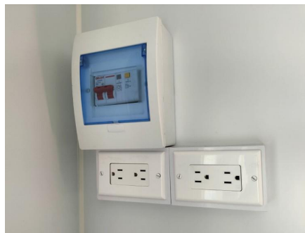
- Electrical System -