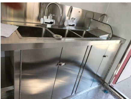
- Sink -