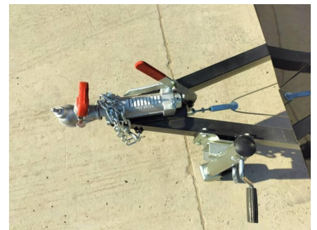
- Tow Bar -