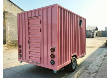
- Rear -