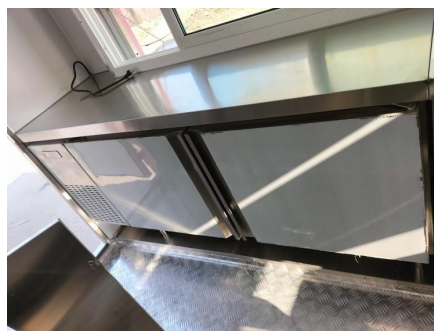
- Refrigeration -