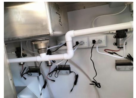
- Water Sink System -