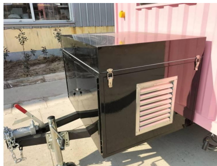
- Generator Cage -